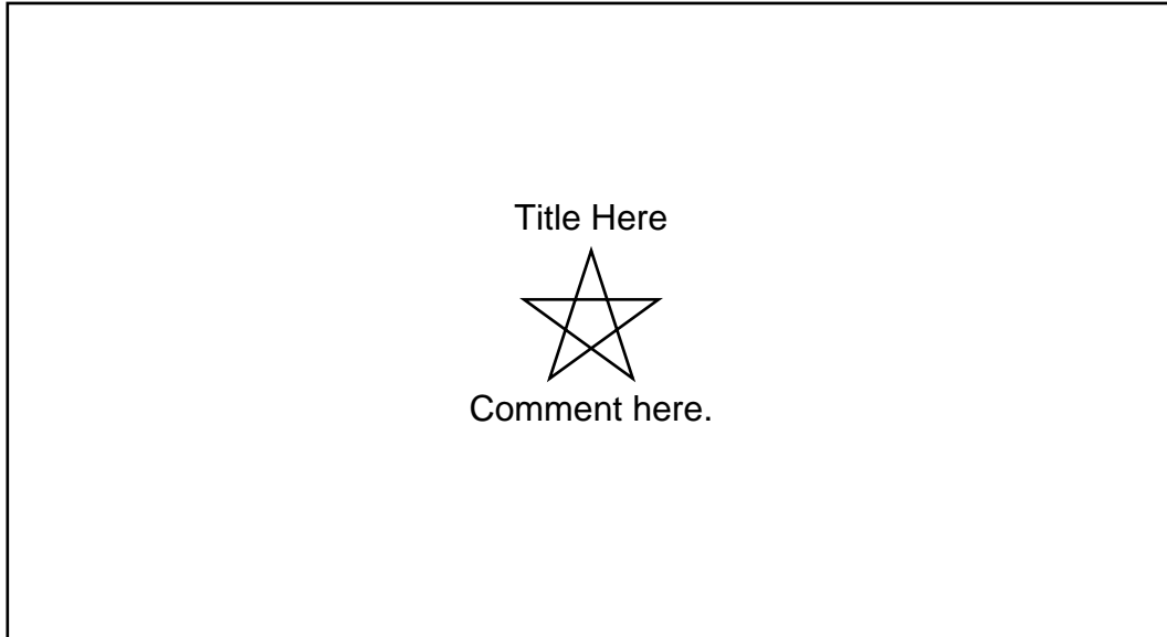
Figure 2-21: line style parameters

The star function has been designed to be useful in illustrating various line style parameters supported by pdfgen.